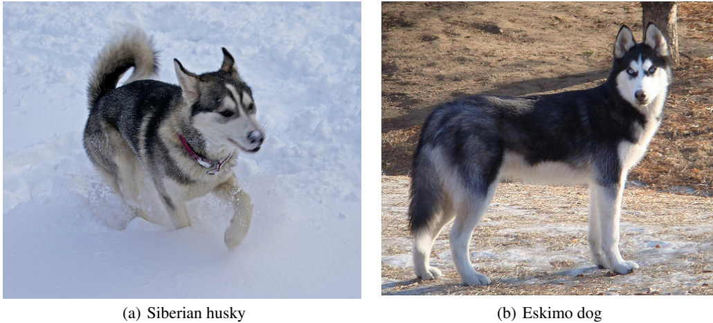
Figure 1: Two distinct classes from the 1000 classes of the ILSVRC 2014 classification challenge.

and expensive, especially if expert human raters are necessary to distinguish between fine-grained visual categories like those in ImageNet (even in the 1000-class ILSVRC subset) as demonstrated by Figure 1.